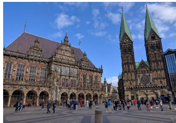
Bremen town square

Without the support of the student travel grant I would not have been able to attend this excellent conference, and as such I am very grateful for this program.