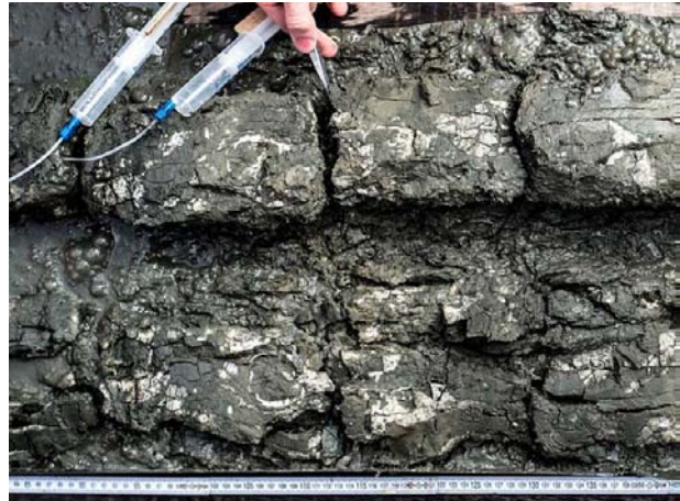
Fig. 4: Part of a recently opened gravity core with white methane hydrates, which transform to water and methane on board. Syringe samples are taken from the sediments are taken to study the pore waters.

The Drygalski Fjord is not only of interest because of its historical connection to the 1st German Antarctic expedition (1901-1903) but also because of its geological structure as a shearing zone as these shearing zones are often used as emission lanes for deep-based fluids. The methane emissions of these fjords could be caused by thermogenic methane, which either rise from depth along the deep disturbance lane or at one of the numerous parallel disturbance, and then emerges from the seafloor. Only when we're back on land can isotope analyses of the methane's carbon and oxygen can tell us if the source is biogenic or thermogenic methane that we sampled in Drygalski Fjord.