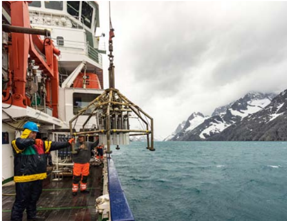
Fig. 3: Multicoresampler sampling in Drygalski-Fjord, named after Erich von Drygalski, the expedition leader of the 1st German Antarctic expedition with RV GAUSS (© Christian Rohleder).

Based on forecasted worsening weather conditions we moved on Monday night eastwards on the southern side of the island and continued our mapping survey on RV METEOR. On Tuesday we carried out station work in the Drygalski Fjord at the south-eastern tip of South Georgia (Fig. 3). While the weather outside the fjord was challenging with high winds and 4-5 m high waves, it was much calmer in the narrow fjord and all station work was possible. At time, strong katabatic winds coming down the over 2000 m high mountains and the Risting Glacier caused winds speeds of 8-10 Beaufort but large wave movements stayed away.